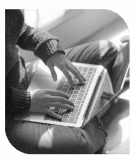
ONLINE ACCESSIBILITY - ANYTIME, ANYWHERE